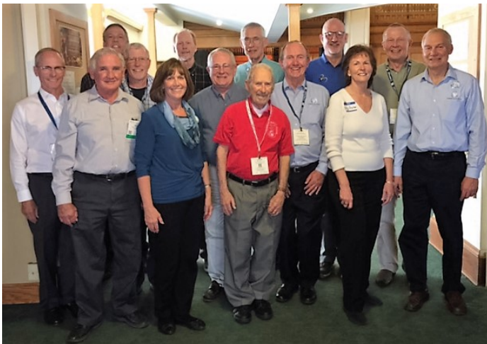
CDS Board and Advisory Council

On Friday, October 20 , the CDS will have our yearly Board Meeting from 1:30-5:00 p. m. at the Atlanta First United Methodist Church. Members of the CDS are encouraged to attend and see what the CDS leadership is planning.