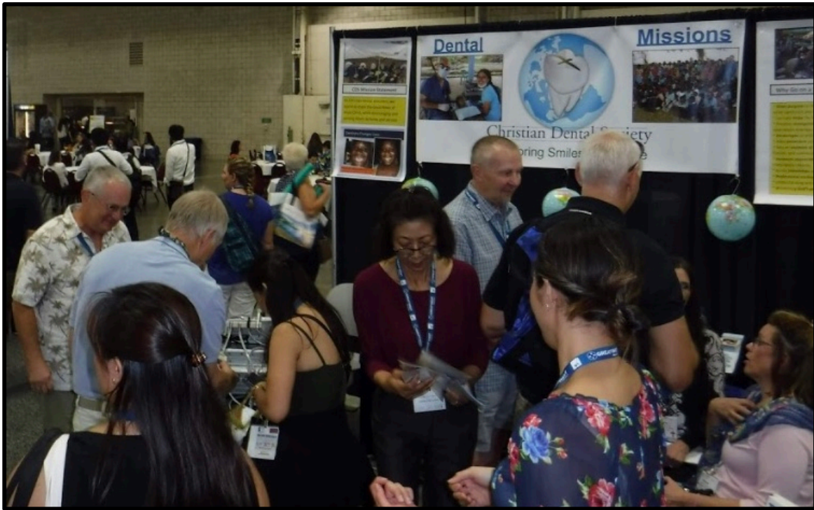
CDS Members and Guests at CDS Exhibit Booth in Hawaii with ADA

The CDS exhibit booths at major dental conventions have been an extremely valuable opportunity to encourage, assist, teach, and equip those interested in dental missions—we connect with hundreds of professionals and potential volunteers each meeting. The CDS plans on exhibiting at dental conventions in Denver on January 17-19 and in Boston on January 31-February 2. The CDS will be in Chicago on February 21-23, Atlanta in March, Anaheim, San Antonio, and Chicago (Pediatric meeting) in May, Pacific Northwest and Kissimmee, Florida in June, San Francisco with the ADA in October, and the Greater New York in November. Check the CDS website under “Events” for exact dates. Please join us if you are able to help us speak with attendees.