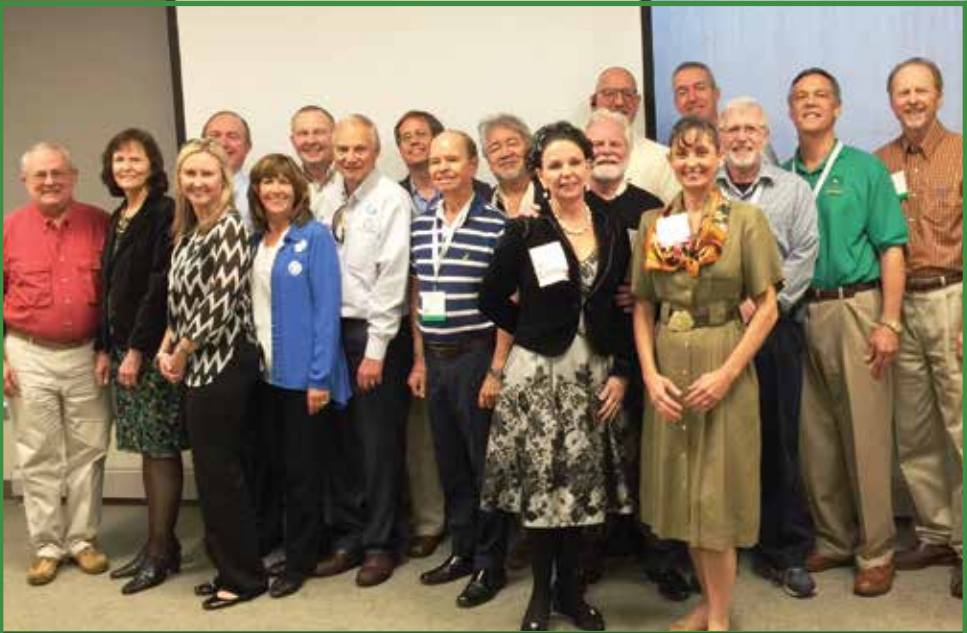
CDS Board and Advisory Council at ADA meeting

The Board Meeting of the CDS discussed many items related to CDS business, development, and growth. Important agenda items are summarized below: