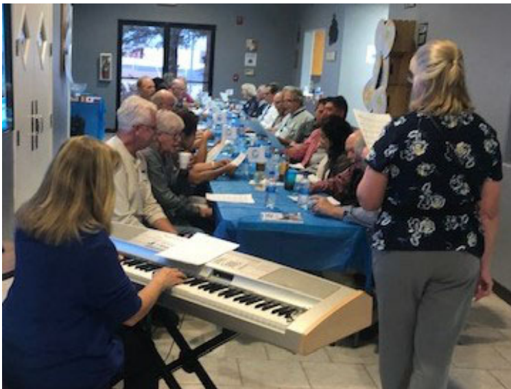
CDS Mission Banquet Singing Hymns