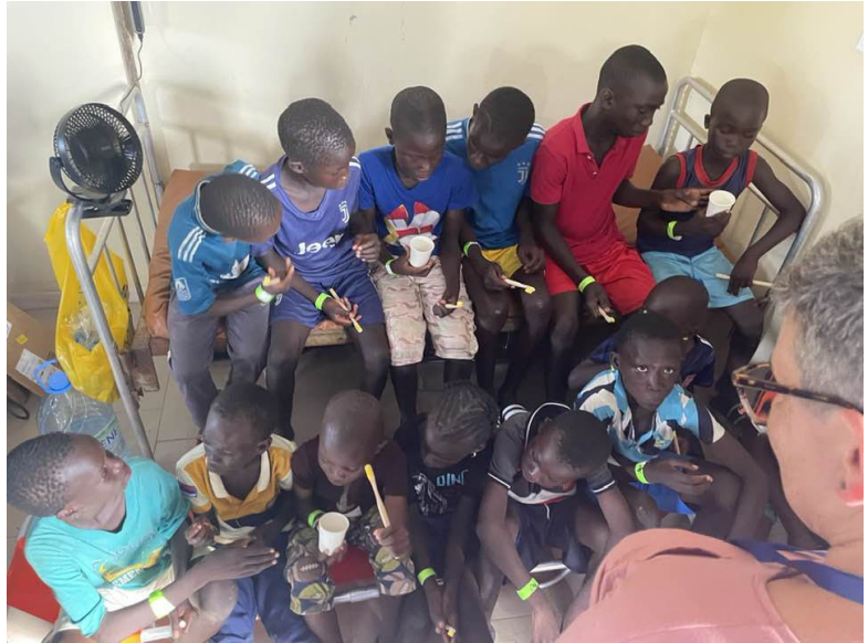
Oral Hygiene instruction for the children